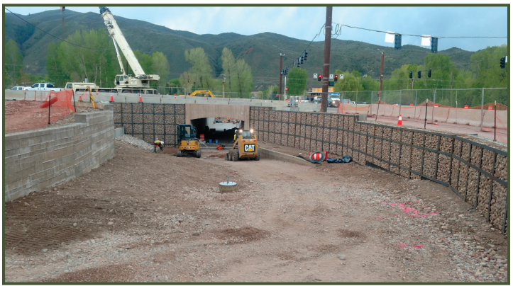
North phase of the project, looking south onto SH 82